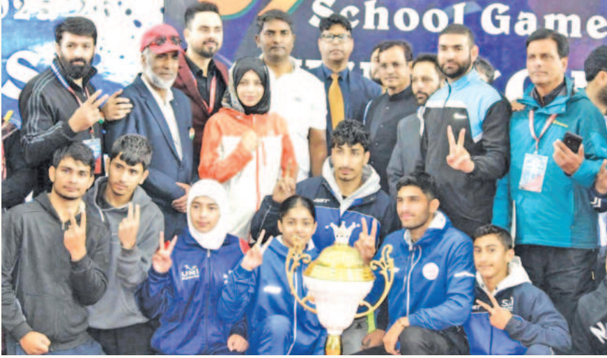
Wushu as a leading martial art among school athletes in India.

SRINAGAR: The 69th National School Games in Wushu (Under-17 Category) for boys and girls concluded on Saturday at Government College of Physical Education, Ganderbal, marking the end of a thrilling sporting spectacle hosted by the Directorate of Youth Services and Sports J&K. In a fitting finale, Team J&K emerged as the overall champion, displaying a commanding performance across both boys' and girls' categories. The host contingent clinched 8 medals — including 4 Gold, 3 Silver, and 1 Bronze, establishing its dominance on home turf. Rajasthan followed closely as the runner-up, with impressive bouts and spirited participation throughout the competition. The championship witnessed intense and disciplined contests among more than 40 teams from various States and Union Territories, showcasing the rapid rise of