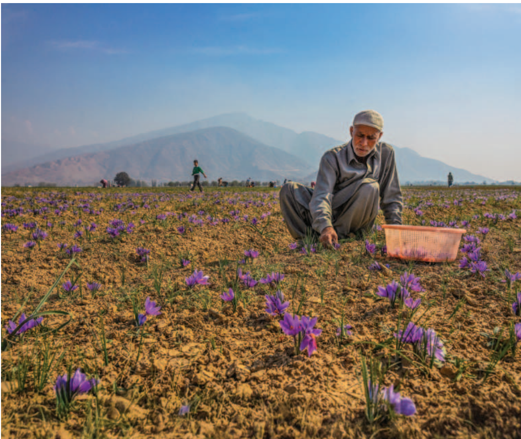
A farmer picks saffron flowers in a field at Pampore.

He added that the neglect was not limited to Srinagar alone. "Even Jammu has not got its due over the said period. The neglect faced by both cities in the last 10 years will be set right by my | More on P6