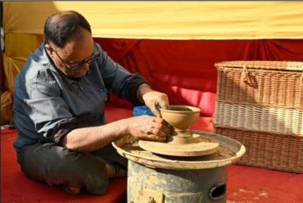
A potter shaping clay on his wheel during an exhibition in Srinagar.

However, the government clarified that “no proposal for an alternate flood channel from Kandizal onwards is under consideration at present.”