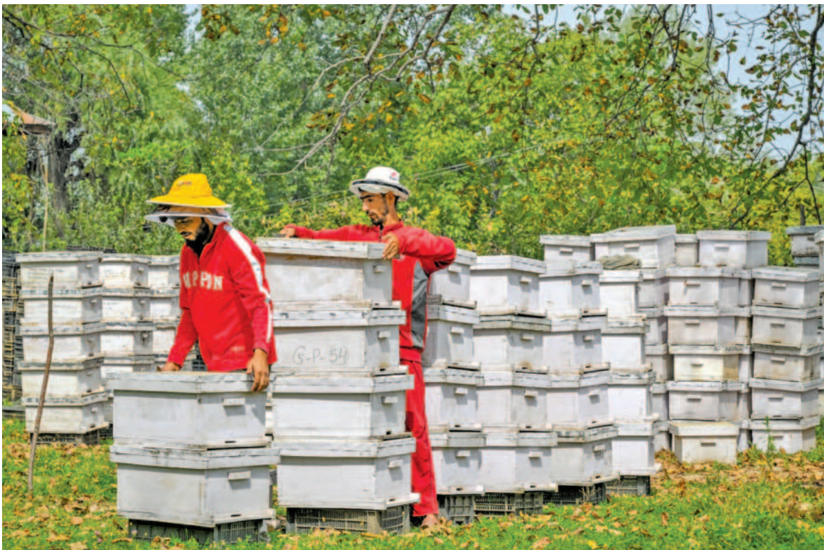
BEEKEEPERS TENDING TO THEIR beehives in the open fields of Ramhama village of Budgam.

Police have registered a case in this regard, and an investigation has been initiated to ascertain the exact circumstances that led to the incident. (KNS)