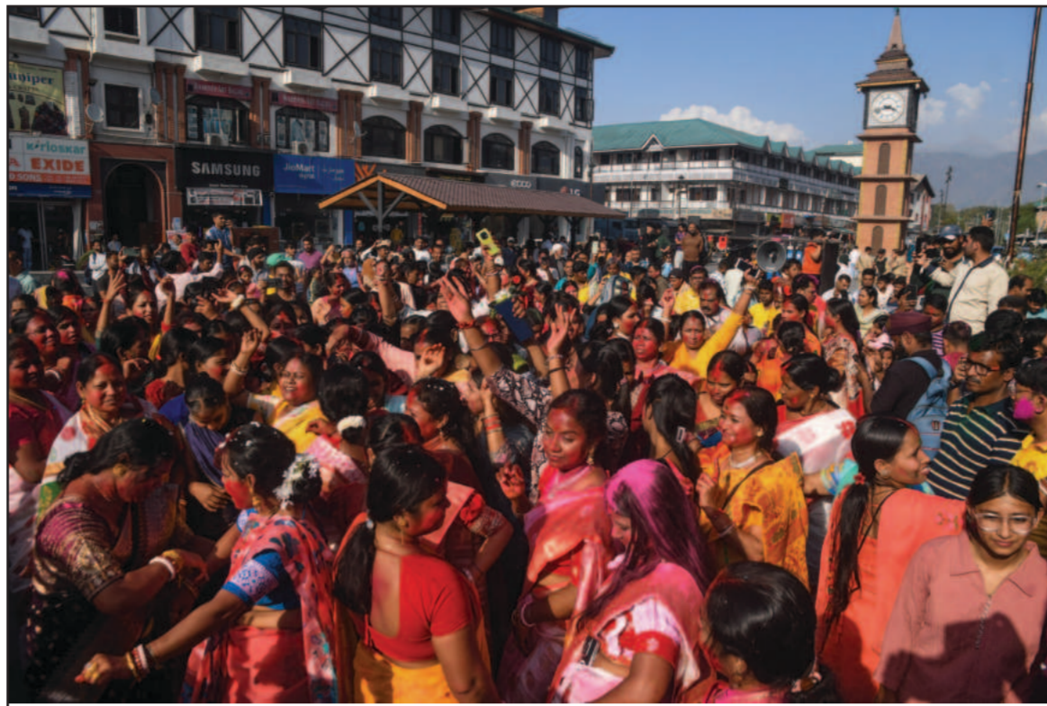
Caption: Devotees participate in Durga Puja rally in Srinagar.

The SMC reaffirmed its dedication to sustaining community-driven initiatives and expanding participatory efforts, emphasizing that collaborative action between citizens and administration is key to building a cleaner, greener, and progressive Srinagar.