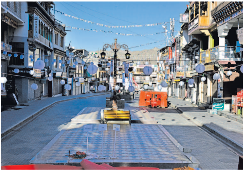
Authorities imposed curfew in Leh on Friday to restore law and order.

WHILE COLD STORAGE UNITS ARE MEANT FOR 'A-GRADE' APPLES, many growers are now bringing 'B-grade' produce due to weak markets, adding pressure.