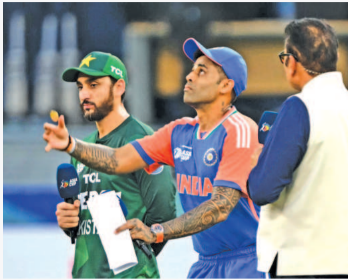
captain of the Pakistani cricket team for "prohibiting" the handshake at toss on Sunday.