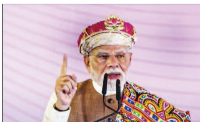
Modi said the world had just witnessed a Pakistani terrorist weeping and recounting the Indian assault. "Just yesterday, the country and the world saw a Pakistani

Speaking after laying the foundation stone of the Pradhan Mantri Mega Integrated Textile Region and Apparel (PM MITRA) Park in Madhya Pradesh's Dhar district,