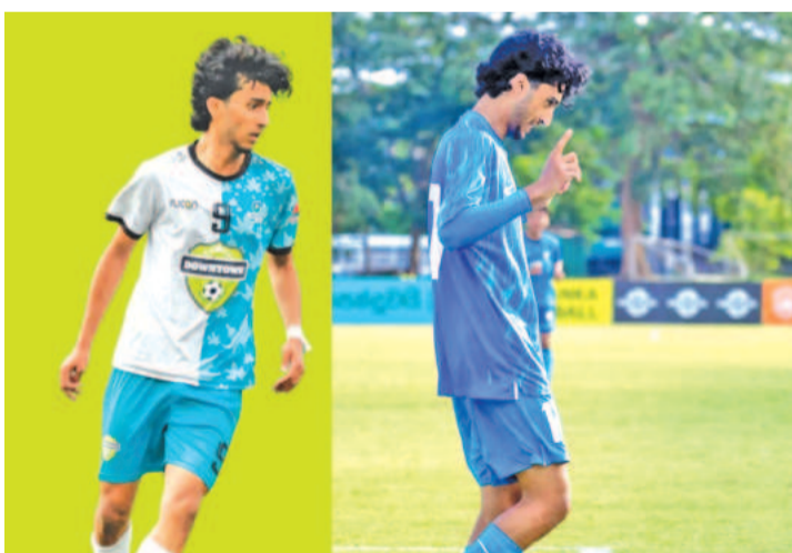
in minute 84 and had an immediate impact, making it 6-0 for India

in their Group B opener against Maldives.