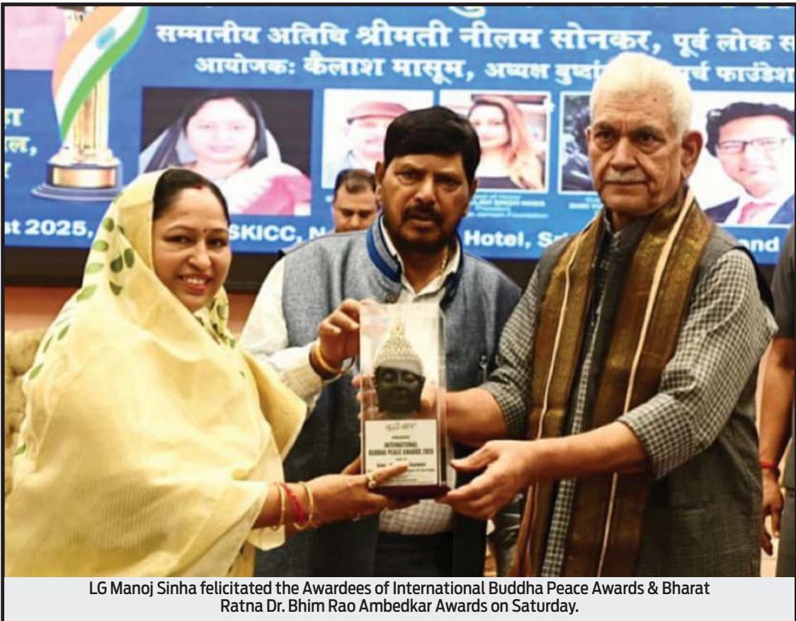
LG Manoj Sinha felicitated the Awardees of International Buddha Peace Awards & Bharat Ratna Dr. Bhim Rao Ambedkar Awards on Saturday.