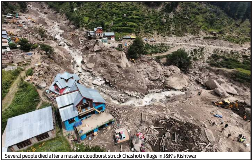
Several people died after a massive cloudburst struck Chashoti village in J&K's Kishtwar

Airlines informed passengers about flight delays due to persistent rain, and low-visibility procedures were put in place intermittently. According to sources, six flights of IndiGo airlines and one each of SpiceJet and Air India were diverted to nearby airports, including Surat, Ahmedabad and Hyderabad. The Mumbai Police and civic authorities appealed to residents to step out of homes only if necessary and also requested the private sector to allow work from home. The India Meteorological Department (IMD) issued a 'red alert' for Konkan region, including Mumbai, Thane, Raigad, Ratnagiri and Palghar districts and adjoining ghat areas of central Maharashtra, warning of extremely heavy rainfall till Wednesday. The IMD said widespread rainfall was very likely over Konkan and Madhya Maharashtra's ghat regions, with heavy to very heavy showers at several places and isolated extremely heavy rainfall.