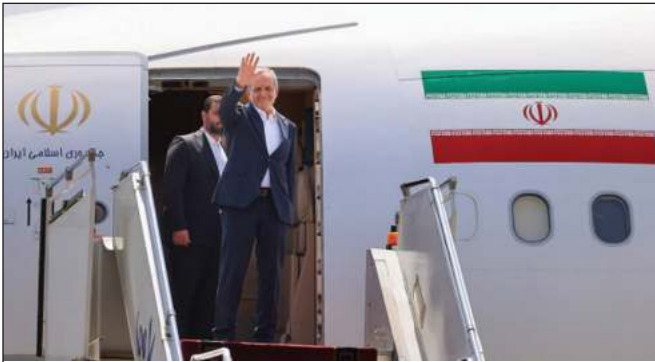
Pezeshkian will be in Armenia to discuss Iranian concerns over US presence in the region, following a US-brokered peace treaty signed by Yerevan and Azerbaijan

Iran has long opposed the planned transit route, also known as the Zangezur corridor, fearing it would cut the country off from Armenia and the rest of the Caucasus while bringing potentially hostile foreign forces close to its borders.