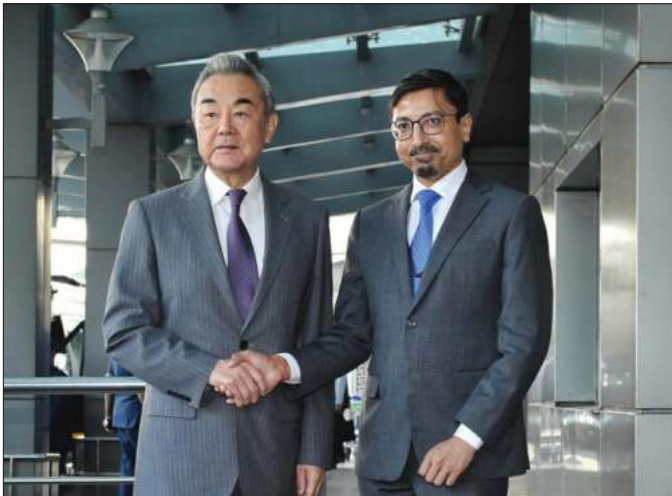
Chinese Foreign Minister Wang Yi is welcomed by an unidentified Indian foreign ministry official upon his arrival at the airport in New Delhi, India, Aug. 18, 2025.

Restarting border trade across their icy and high-altitude Himalayan border is expected to feature high on Wang's agenda.