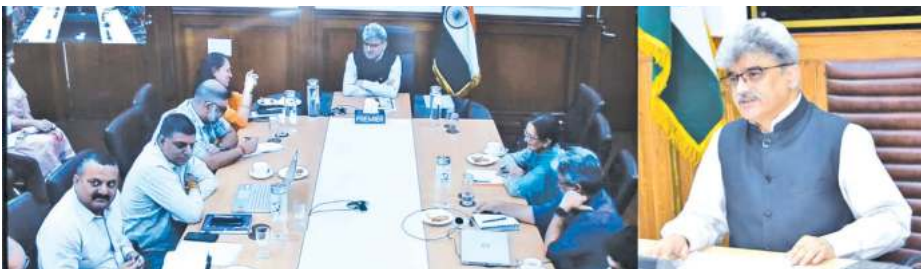
Observer News Service

In 2024, the companies exported goods worth over $2 billion and in the first half of 2025 shipped products of about $1 billion to U.S. clients including Walmart, Target, Costco and Gap.