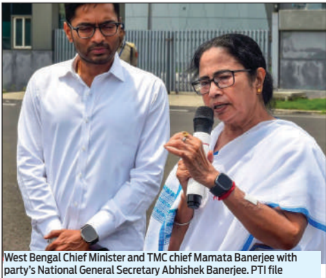
West Bengal Chief Minister and TMC chief Mamata Banerjee with party's National General Secretary Abhishek Banerjee.

Serampore MP Kalyan later took to X saying he had resigned in protest of colleague Mahua Moitra ‘dehumanising’ comments in