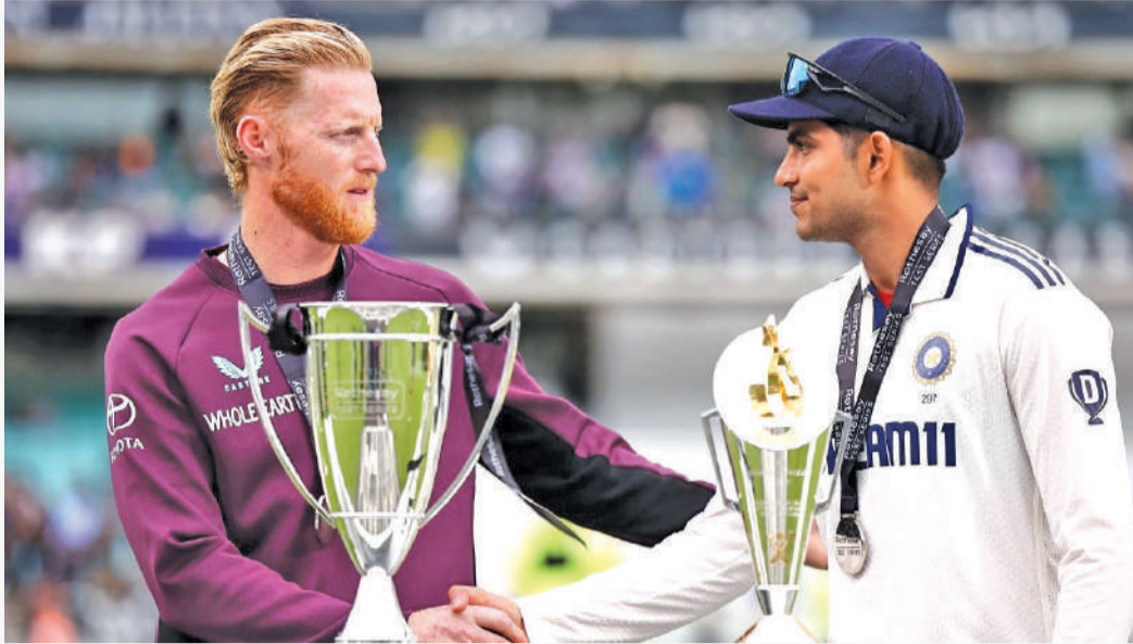
India-England Rivalry Has Always Been Big: Stokes On Ashes Comparison

"So, if you keep working hard, if you keep doing the right things, there is always a second chance. So, in my opinion, this is the most rewarding, and satisfying format, I don't think there should be any changes made to this format," said a beaming Gill.