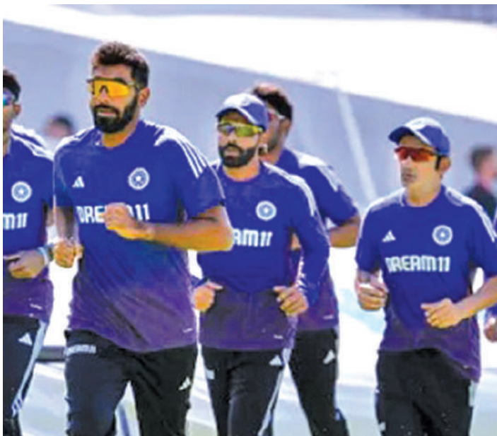
about team combinations minutes after India's comeback win over