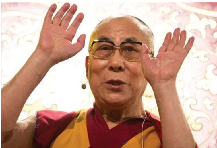
Traditionally, Tibetan leaders and aides seek a young boy who is seen as the chosen reincarnation of the Dalai Lama. It is possible that after they do this, this time Beijing will try to appoint a rival figure.

Beijing views western criticism of its control of Tibet as inter-