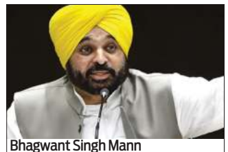
Bhagwant Singh Mann

a Yamuna Sutlej Link (YSL) canal instead of the Sutlej Yamuna Link (SYL) canal, according to a statement from the chief minister's office on Wednesday.