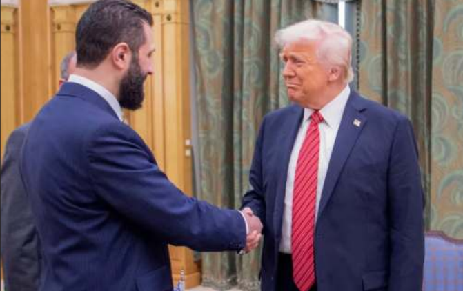
US President Donald Trump meeting with Syrian President Ahmed al-Sharaa in Riyadh on May 14, 2025

“Tomorrow’s action follows the announced dissolution of HTS and the Syrian govern-