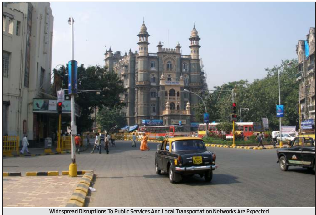
Widespread Disruptions To Public Services And Local Transportation Networks Are Expected

A member, sources said, claimed that while user charges have risen, the convenience for travellers has declined.