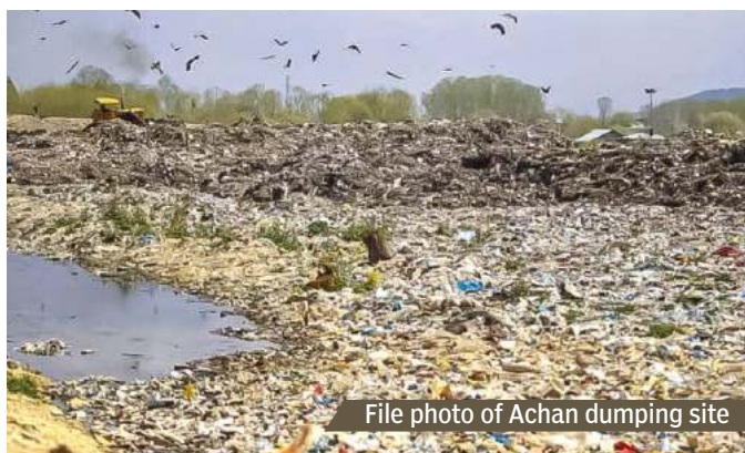
File photo of Achan dumping site

The group demanded an immediate scientific survey of the gas emissions, regular air quality checks, and OSHA-style public advisories so that residents understand the risks and know how to protect themselves. They also called for health departments to issue guidelines to