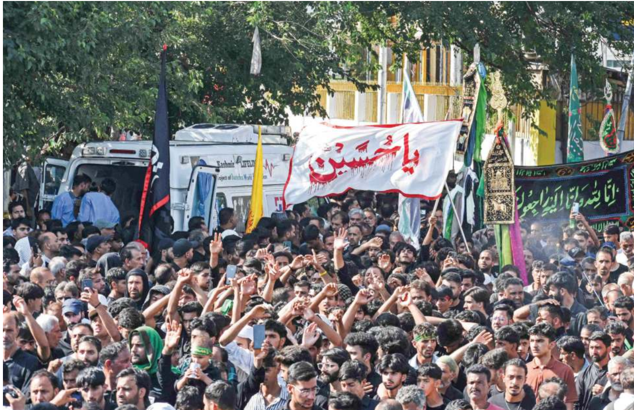
Thousands joined the traditional 7th Muharram procession in the old city of Srinagar.

On Wednesday, Jammu and Kashmir Lieutenant Governor Manoj Sinha had flagged off the first batch of 5,892 yatris from the More on P10