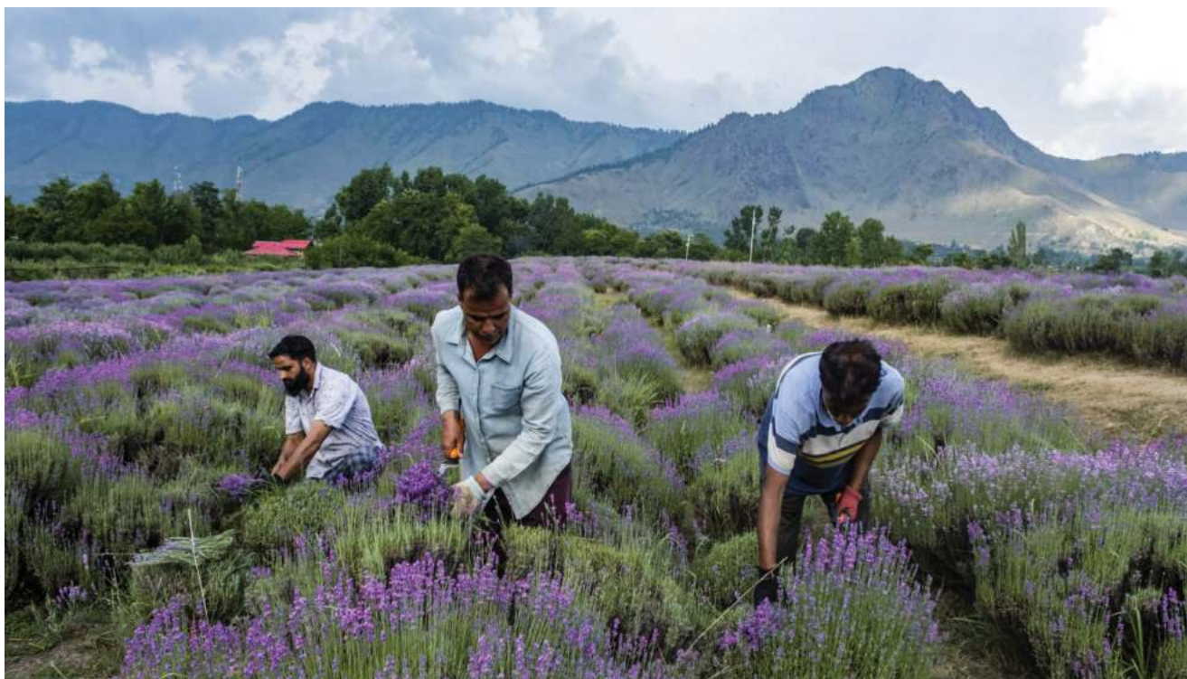
Farmers harvest lavender flowers in a field in Sirhama, Bijbehara, in south Kashmir's Anantnag district.

The flight landed "safely" back in Mumbai, and an aircraft change was initiated, Air India said without giving specific details. The airline further said | More on P6