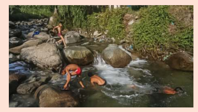
Observer News Service

Records 4th Hottest June Night In 134 Years