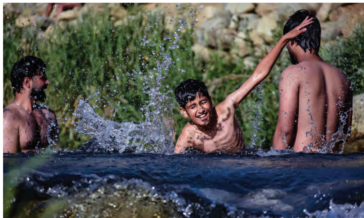
Boys bathe in a stream to beat the heat amid rising temperatures across J&K.

"J&K CM Omar Abdullah Sahab says he's running a 'hybrid government', but... why no cabinet expansion | More on P10