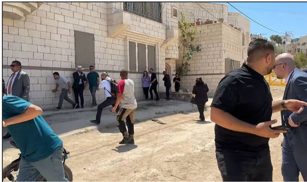
Screengrab from AFPTV footage shows members of EU diplomatic delegation reacting after shots fired as they gathered in eastern entrance of Jenin camp during visit to city of Jenin, May 21.

"Though a decision was taken in the 47th board meeting of CVPPPL for re-tender through e-tendering with a reverse auction after the cancellation of the ongoing tendering process, the same was not implemented (according to the decision taken in the