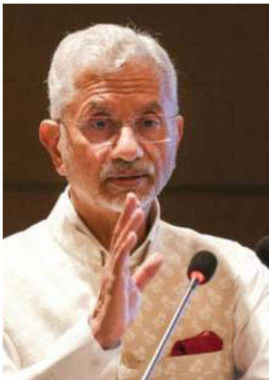
Hague as part of his three-nation tour of the Netherlands, Denmark and Germany.

“The operation continues because there is a clear message in that operation - that if there are acts of the kind we saw on April 22, there will be a response, that we will hit the terrorists,” he said.