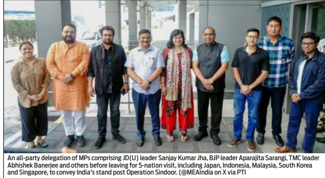
An all-party delegation of MPs comprising JD(U) leader Sanjay Kumar Jha, BJP leader Aparajita Sarangi, TMC leader Abhishek Banerjee and others before leaving for 5-nation visit, including Japan, Indonesia, Malaysia, South Korea and Singapore, to convey India's stand post Operation Sindoor.

Besides Shinde, the delegation comprises Manan Kumar Mishra (BJP), Sasmit Patra (BJD), E T Mohammed Basheer (IUML), S S Ahluwalia (BJP), Atul Garg