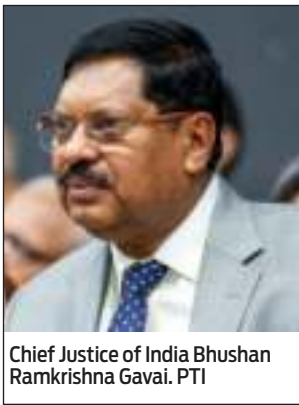
Chief Justice of India Bhushan Ramkrishna Gavai.

Pakistan's attempt to hoodwink world doomed to fail: India on Islamabad's allegations'