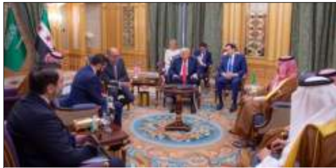
Saudi Crown Prince Mohammed bin Salman (3-R) hosts a conference call between US President Donald Trump (C), US Secretary of State Marco Rubio (R-C) and Syria's de facto leader Abu Mohammad al-Jolani (2-L) in Riyadh, Saudi Arabia.

Rubio stressed that sanctions relief "will not suffice," urging "congressional action or a