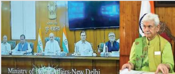
Observer News Service

New Delhi: Jammu and Kashmir Lieutenant Governor Manoj Sinha on Wednesday said that the instructions of Union Home Minister Amit Shah, given during a high level meeting in the aftermath of Operation Sindoor, will be implemented in letter and spirit.