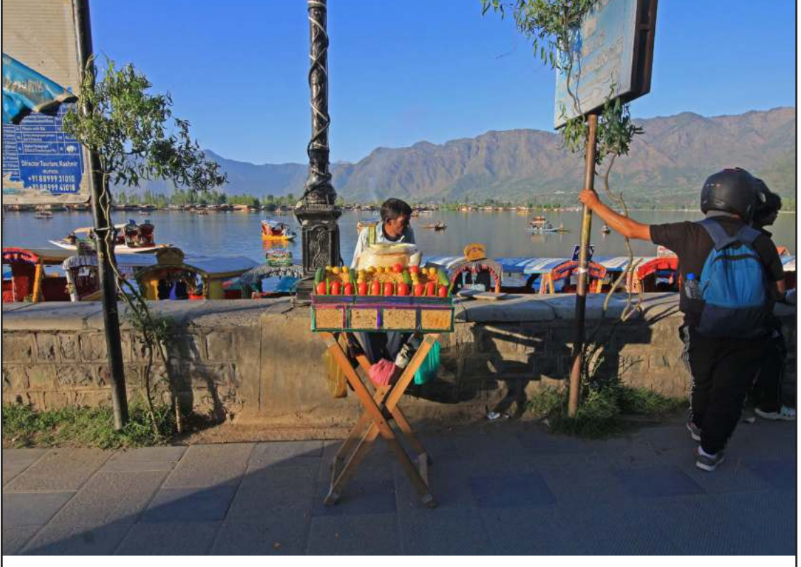
A bhepuri seller waits patiently for customers along Boulevard Road in Srinagar.

During the programmes, awareness sessions on the risks and consequences of drug addiction were held and information regarding Government schemes and benefits for those struggling with addiction were highlighted in detail.