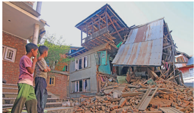
KO Photo | Faisal Khan