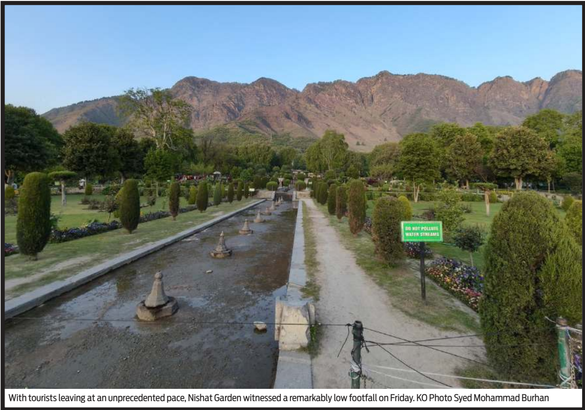
With tourists leaving at an unprecedented pace, Nishat Garden witnessed a remarkably low footfall on Friday.