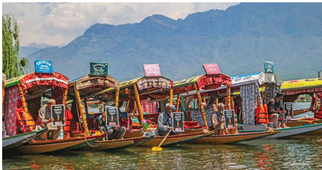
Shikara owners at Dal Lake in Srinagar protest against the attack on tourists in Pahalgam.