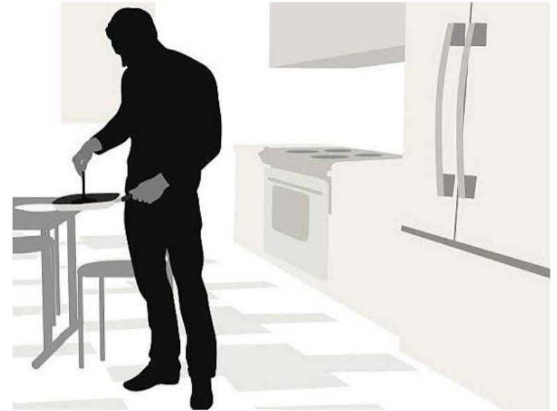
Shah Zeeshan Fazil

Women are excelling in careers, but at home, they still carry the bulk of the load. It's time for men to share the responsibility, not just "help."