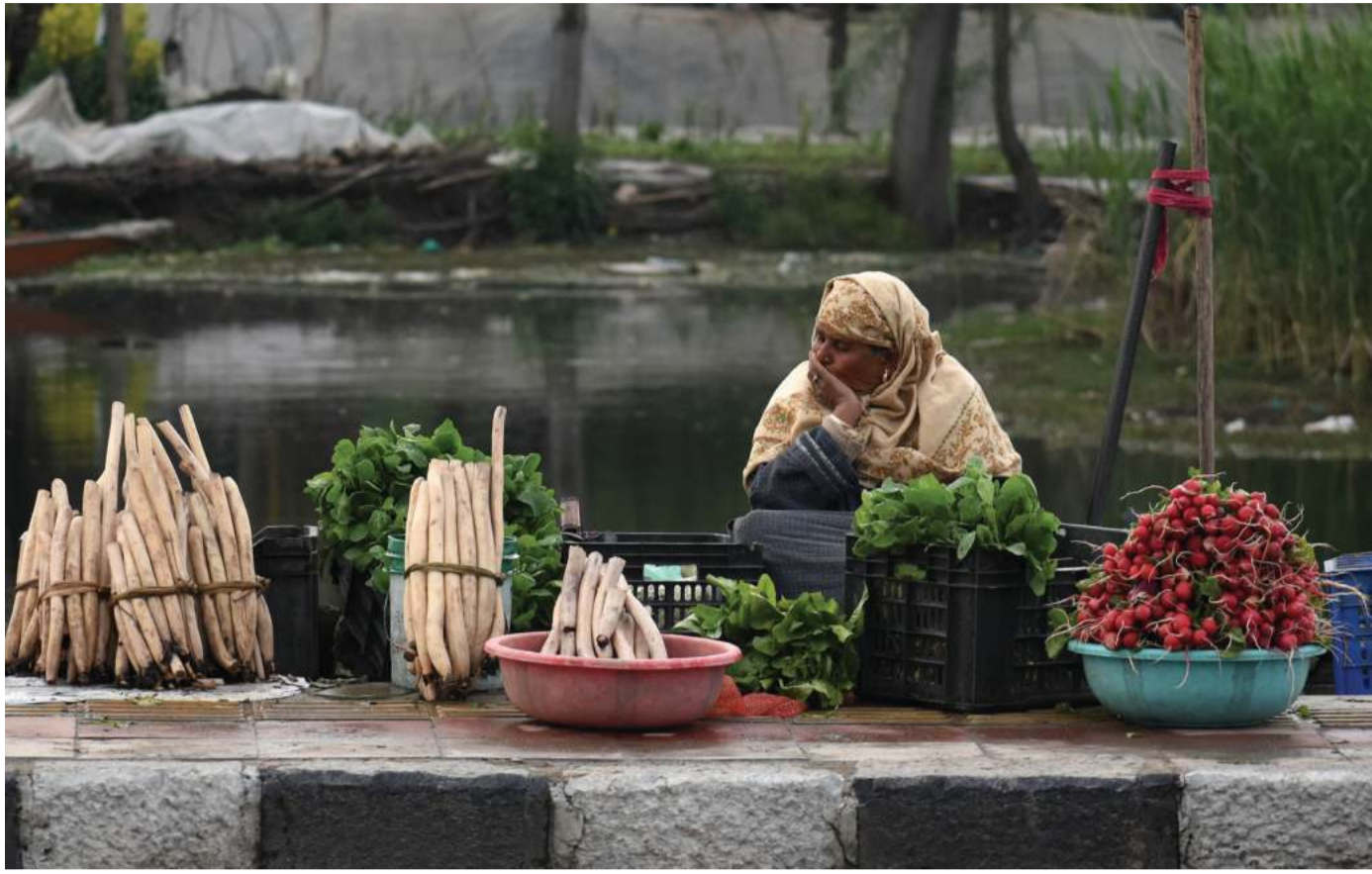
Quiet hustle: A woman vendor waits for customers at her vegetable stall in Srinagar.

The petition maintained that the funds involved in such transfers are not defined as goods or services under the GST Act, and the interest earned is exempt from tax. The bank further said it has consistently filed GST returns showing nil liability on More on P6