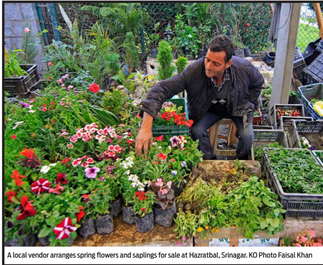
A local vendor arranges spring flowers and saplings for sale at Hazratbal, Srinagar.

A senior official from GMC Srinagar said, "This initiative will showcase the academic strength of J&K and bolster national-level collaborations in healthcare." The conference is expected to contribute to policy development, healthcare delivery improvement, and the integration of public health with academic medicine across India.