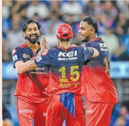
wins at varied Visakhapatnam and Chennai tracks.

The RCB will be wiser for that experience against the Delhi side, who have