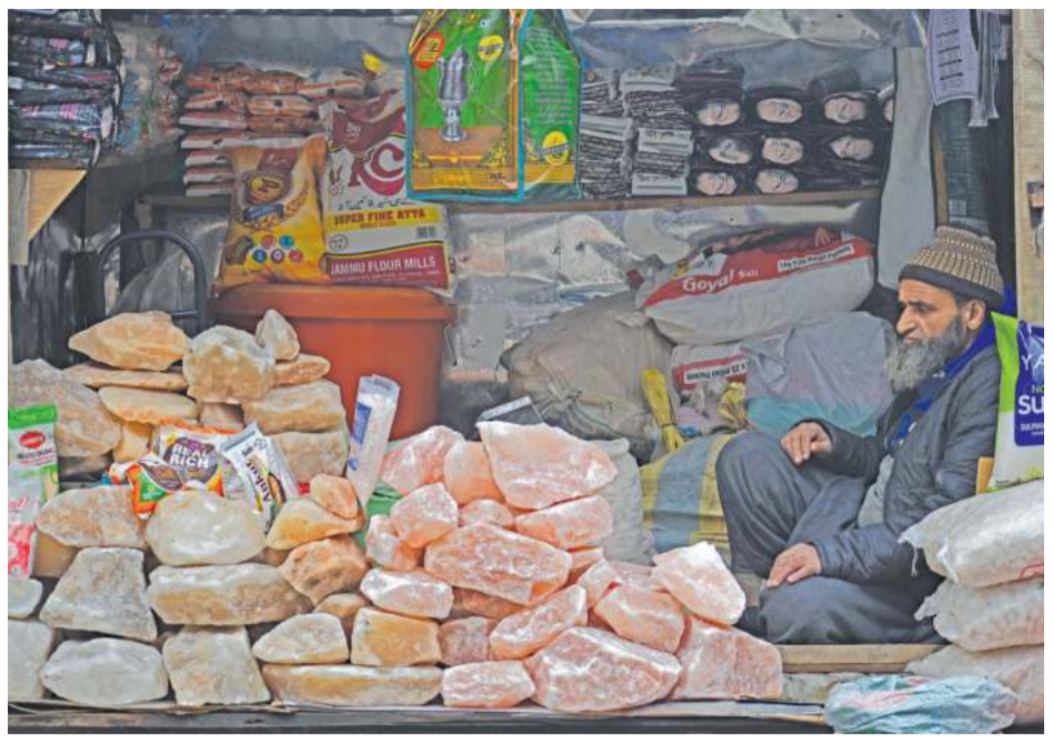
AN ELDERLY MAN SELLING ROCK SALT at his small shop in Old Srinagar, surrounded by sacks of essential goods.

The campaign aims to spread awareness, encourage rehabilitation, and mobilize community support to eliminate the menace of drugs from Ganderbal district.