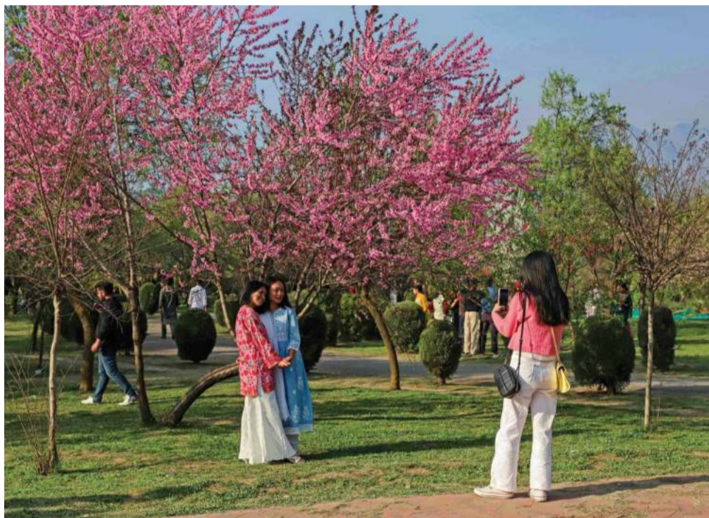
Tourists enjoy spring blossoms at Badam Wari, Srinagar.