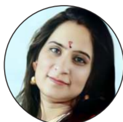
Dr Priyanka Saurabh

“While the government increased the dearness allowance (DA) of government employees by only 2%, it hiked the allowances and salaries of MPs by 24%. This contradiction is creating resentment among employees and the public.”