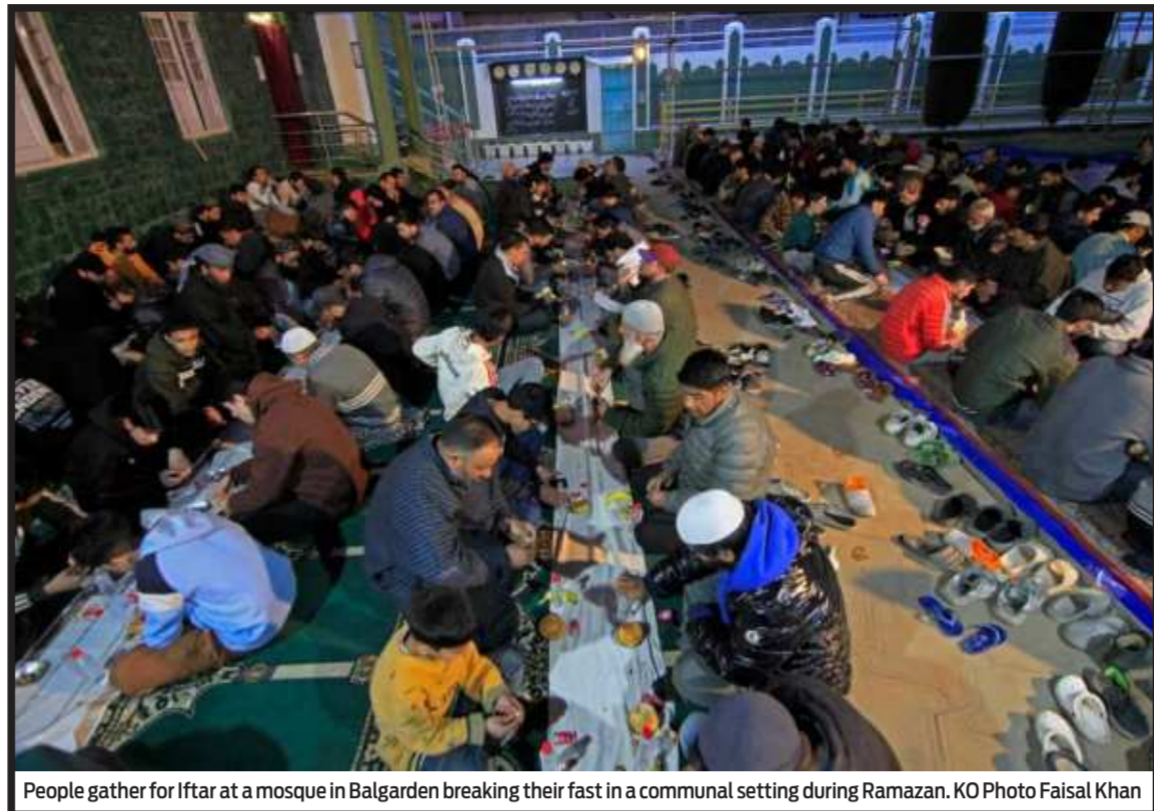
People gather for iftar at a mosque in Balgarden breaking their fast in a communal setting during Ramadan.

a communication from the Chief Engineer, Irrigation & Flood Control Kashmir, dated April 2, 2016, which revoked the No Objection Certificate (NOC) for the project due to concerns that the bridge's height would require raising road levels on both the Convent and GPO sides by approximately 2.5 meters, making it impractical for vehicular movement. Asked whether the government intends to convert the footbridge into a motorable bridge or construct an alternative parallel bridge near Abdullah Bridge to ease traffic congestion, the department said the proposal remains under examination.