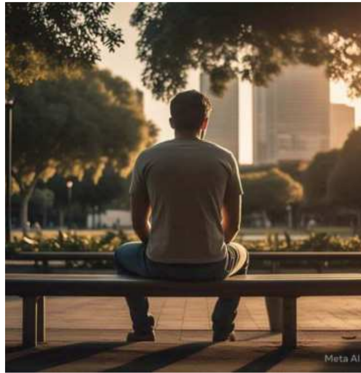
AI generated image for representational purposes only

But soon, schoolwork increased. At age seven, my tutor made me join a Darsgah —a place to study the Quran. It was one of the most difficult turns of my life. I despised it. I felt oppressed. I had planned to go home and watch Tom & Jerry —but no. I've always hated unplanned things, and this was forced upon me. Make no mistake—I had memorized all the Kalimas and some Surahs before I was six. But