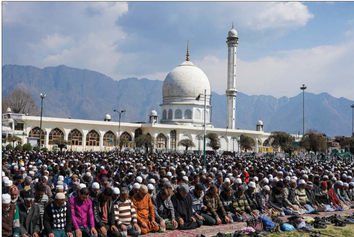
Thousands gather at Hazratbal Dargah for prayers on the third Friday of Ramadan.

The Home Minister asserted that before 2014, terrorists frequently infiltrated Kashmir from across the | More on P6