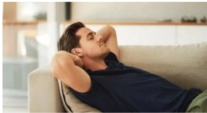
harder to fall asleep at night.

throughout the day. The early afternoon lull is part of this rhythm, which is why so many people feel drowsy at that time. Studies suggest that a short nap during this period - ideally followed by bright light exposure - can help counteract fatigue, boost alertness, and improve cognitive function without interfering with nighttime sleep. These "power naps" allow the brain to rest without slipping into deep sleep, making it easier to wake up feeling refreshed. But there's a catch: napping too long may result in waking up feeling worse than before. This is due to "sleep inertia" - the grogginess and disorientation that comes from waking up during deeper sleep stages. Once a nap extends beyond 30 minutes, the brain transitions into slow-wave sleep, making it much harder to wake up. Studies show that waking from deep sleep can leave people feeling sluggish for up to an hour. This can have serious implications if they then try to perform safety-critical tasks, make important decisions or operate machinery, for example. And if a nap is taken too late in the day, it can eat away from the "sleep pressure build-up" - the body's natural drive for sleep - making it