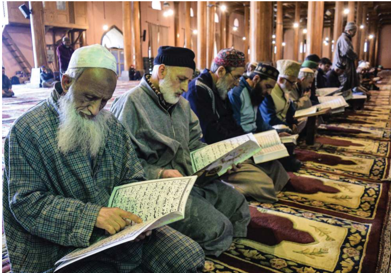
Devotees recite Quran inside Srinagar's historic Jamia Masjid on 17th of Ramazan.

Furthermore, the government stated that the registration of the Kashmir Press Club has been put on hold by the Department of Industries and Commerce, pending clearance from the Criminal Investigation Department. However, another entity, the Press Club of Kashmir, has been | More on P6