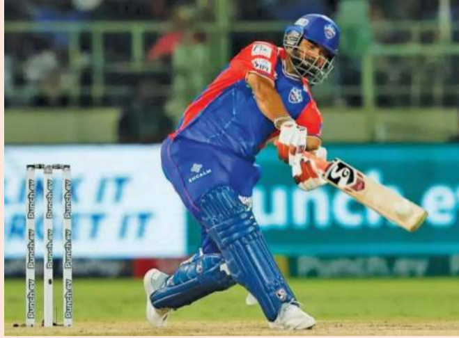
everything else—including the IPL—will eventually fall into place," Pant told JioHotstar. "If you have that bigger

"Since childhood, I had only one dream—to play for India. I never even thought about playing in the IPL. I think today, people are more focused on the IPL. Of course, it's a great platform, but I believe that if your goal is to play for your country,