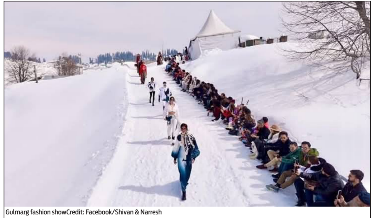
Gulmarg fashion show

However, the garden's popularity has become its Achilles' heel. Overcrowding during the blooming season has turned this serene escape into a chaotic maze of selfie sticks and jostling crowds. The narrow pathways are jam-packed, leav-