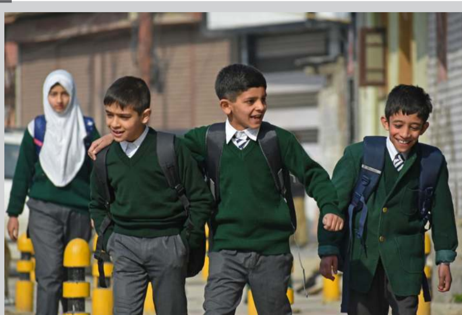
STUDENTS WALK CHEERFULLY as schools reopened in Kashmir on Friday after winter break.