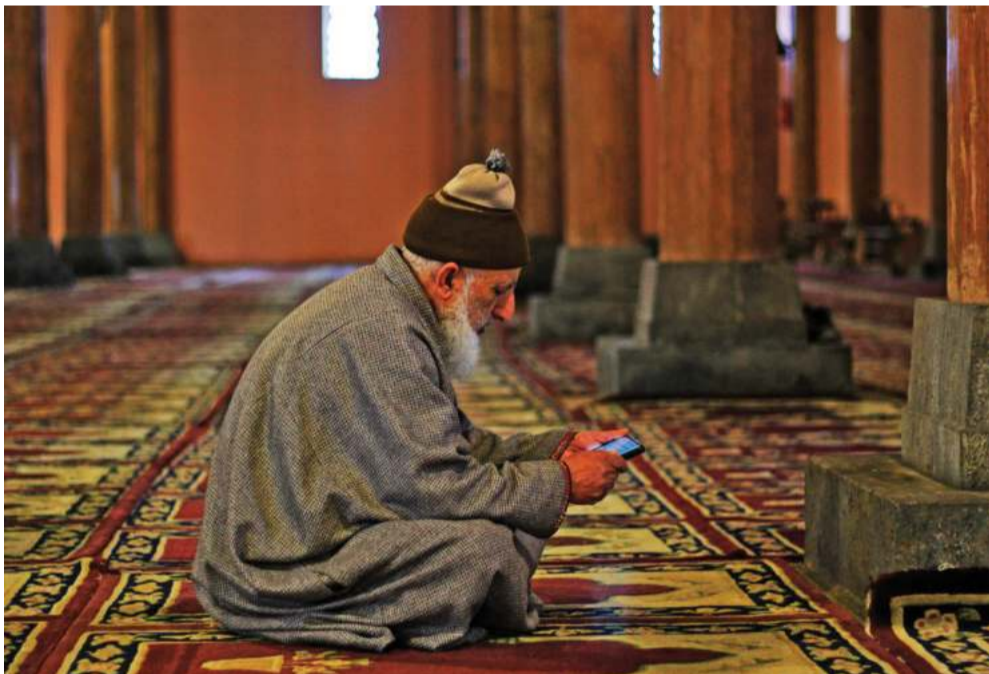
Faith in solitude: An elderly man's quiet moment reading the Quran inside Srinagar's historic Jami Masjid.

Referring to Peoples Conference legislator Sajad Gani Lone's demand that a resolution should have been passed in the House for restoration of statehood instead of passing the resolution in the cabinet meeting, he said such a resolution was not deliberately moved in the House considering that every member is supportive of the demand. "Our dignity has gone with the downgrading of the state (to Union Territory). If you wish to move a resolution on it, please go ahead and we will support you," he said. He said the fight for statehood is based on "truth, justice and law" and its restoration | More on P6