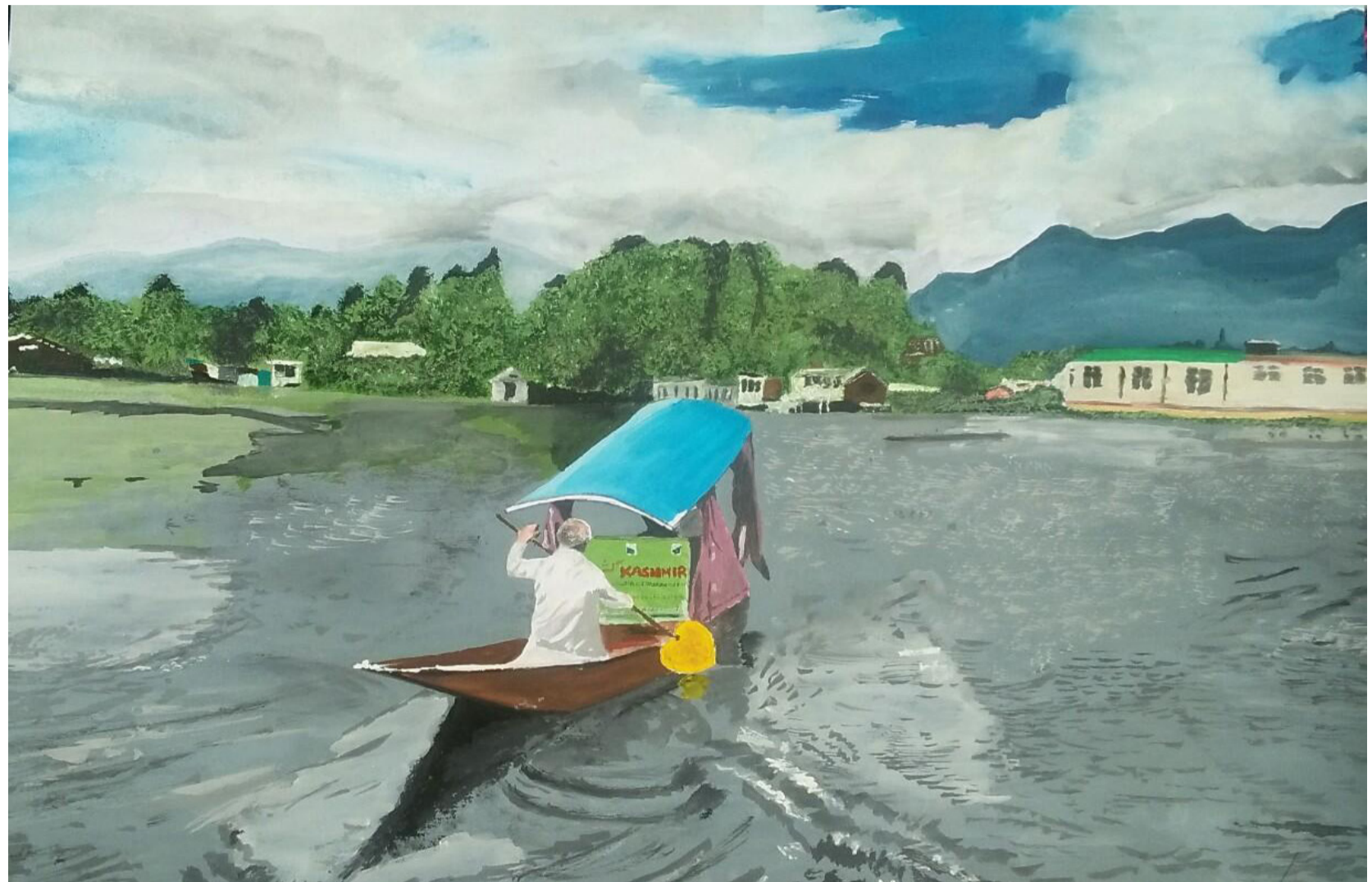
Artwork by author