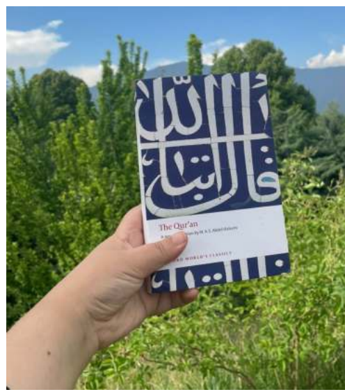
immense blessings of Ramazan and seek salvation. Here are some ways

It is the month of spiritual cleansing and purification for us. We should try to increase our worship, good deeds and acts of charity so that we are able to benefit from the