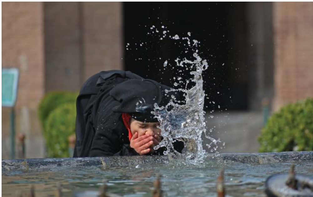
Ramazan Reflections: A young girl washes her face at a fountain inside Srinagar's historic Jamia Masjid.