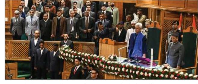
LG's arrival and remain seated until the LG leaves after the speech. Further, they have been reminded to listen attentively with respect and uphold the solemnity of | More on P6

Observer News Service Jammu: The Lieutenant Governor (LG) of Jammu and Kashmir Manoj Sinha will address the Members of the Legislative Assembly (MLAs) at the Assembly complex in Jammu on March 3, 2025, at 10:00 AM. As such, the MLAs have been directed to maintain dignity and decorum during the LG's address. They are also directed to take their seats five minutes before the