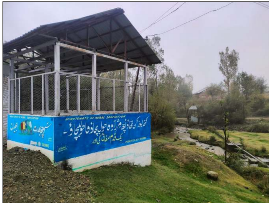
is still on a small scale.

Why are we witnessing these extreme weather patterns? The primary reason appears to be increased anthropogenic activities. Every visible sight in rural hamlets is filled with solid waste trash. What is the practical mechanism in place to mitigate this solid waste? Who has the mandate to clear this mess? Every open space is littered. Our water bodies—be it rivulets, streams, springs, or rivers—are choked with non-biodegradable waste, such as diapers, sanitary pads, and single-use plastic. Look at the daily consumption of these items; they keep piling up in the environment. The problem with diapers is that they hardly decompose and cannot be reduced to ashes at normal temperatures. Incinerators can do this job, but their use