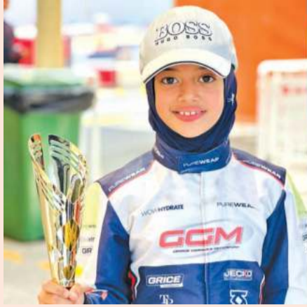
starting this weekend.