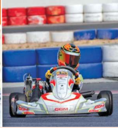
cal support, covering her fitness, driving and mental preparation.