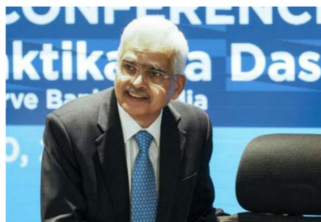
mittee of the Cabinet has approved the appointment of Shri Shaktikanta Das, IAS (Retired), as Princi-

pal Secretary-2 to Prime Minister with effect from the date he assumes the office. His appointment will be co-terminus with the term of the Prime Minister or until further orders, whichever is earlier," the order read.