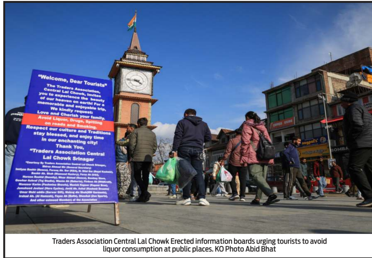
Traders Association Central Lal Chowk Erected information boards urging tourists to avoid liquor consumption at public places.

The 2023-24 season witnessed an unprecedented 4.46 lakh visitors, comprising local, national, and international tourists, marking an all-time high in the garden's history.