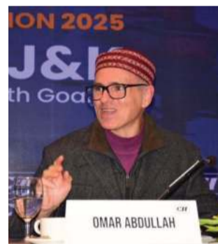
business potential through a robust and resilient industrial and sustainable entrepreneurship ecosystem. | More on P6

The event, organized by the Confederation of Indian Industry (CII) J&K Council, brought together business leaders, industrialists, entrepreneurs, and other stakeholders to discuss strategic actions to boost J&K's economic growth and development, driving the region's competitiveness and