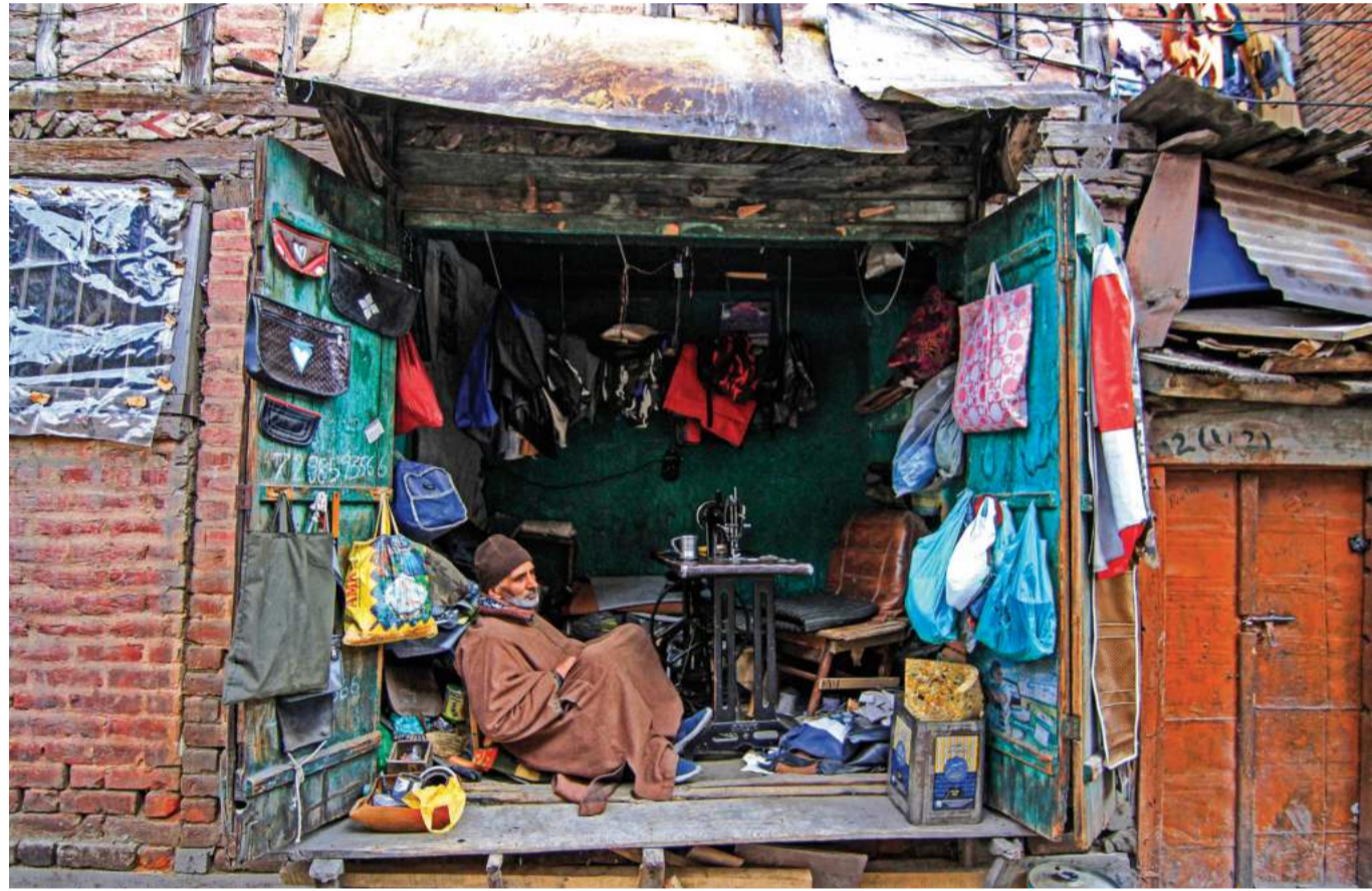
A SEASONED UPHOLSTERER, SURROUNDED BY BAGS, fabric scraps, and a sewing machine, rests inside his modest shop in Srinagar.

Residents called for the preservation of water bodies. "Our lives depend | More on P6