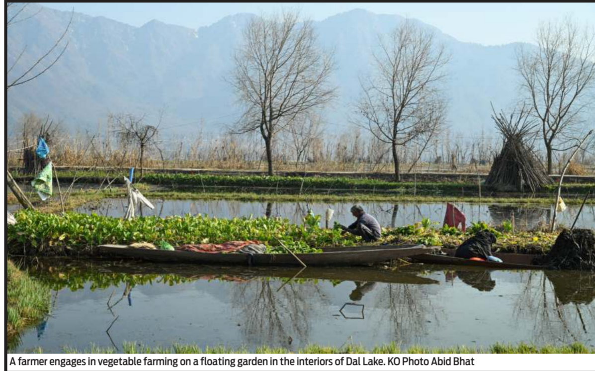
A farmer engages in vegetable farming on a floating garden in the interiors of Dal Lake.

He stated that this book provides detailed guidance on the selection, design, and implementation of waste materials in pavement construction, with a focus on practical applications. The book also features case studies showcasing successful real-world projects.