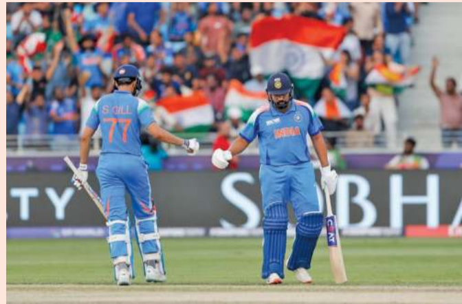
and is the second fastest behind Kohli to cross 11,000 runs in terms of innings.

The seasoned opener reached the mark in his 270th game,