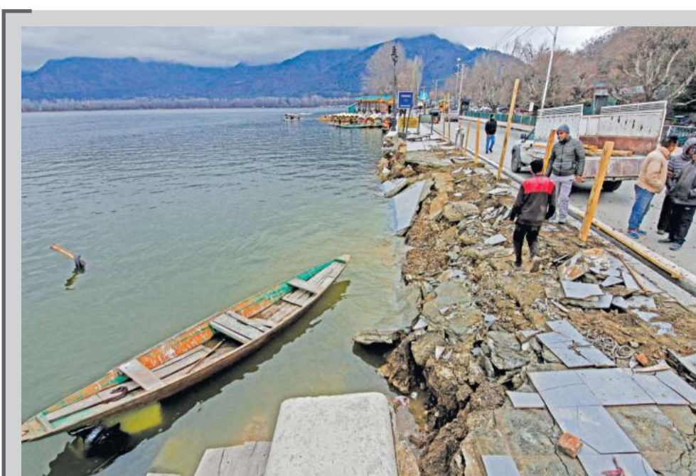
SMART CITY OR COSMETIC FIX? Rainfall triggers a footpath collapse on Boulevard Road, raising safety concerns among locals..

The tribunal has been urged to closely monitor the situation and ensure timely action to address the pollution crisis and hold the responsible officials accountable.