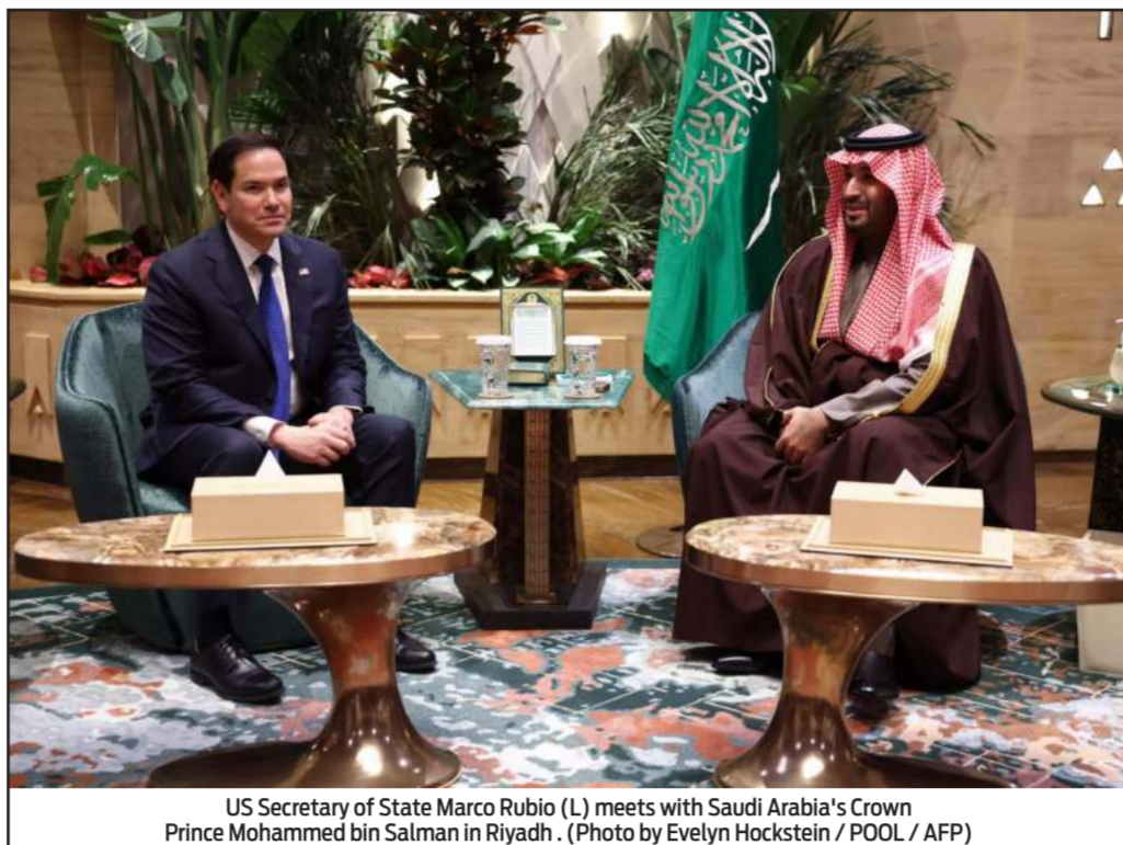
US Secretary of State Marco Rubio (L) meets with Saudi Arabia's Crown Prince Mohammed bin Salman in Riyadh.

"It is not a blanket order. Except one student, there is nobody who studies Urdu as the third language in a government school in Napsar, Bikaner. This is the reason why it was discontinued," he said.