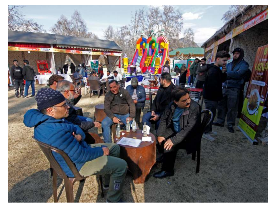
HUNDREDS OF PEOPLE attended the MIRCHI food festival on the second day of its commencement.