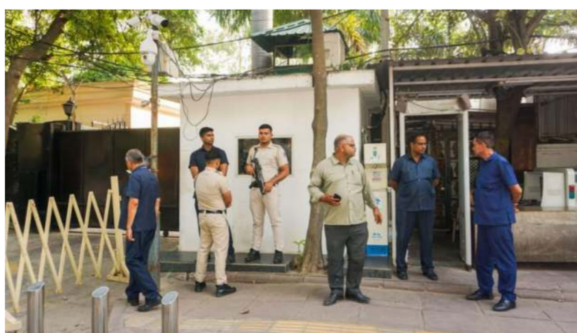
The bungalow labelled as 'Sheesh Mahal' by the BJP for alleged corruption was occupied by Arvind Kejriwal as the Delhi CM from 2015 till the first week of October 2024.