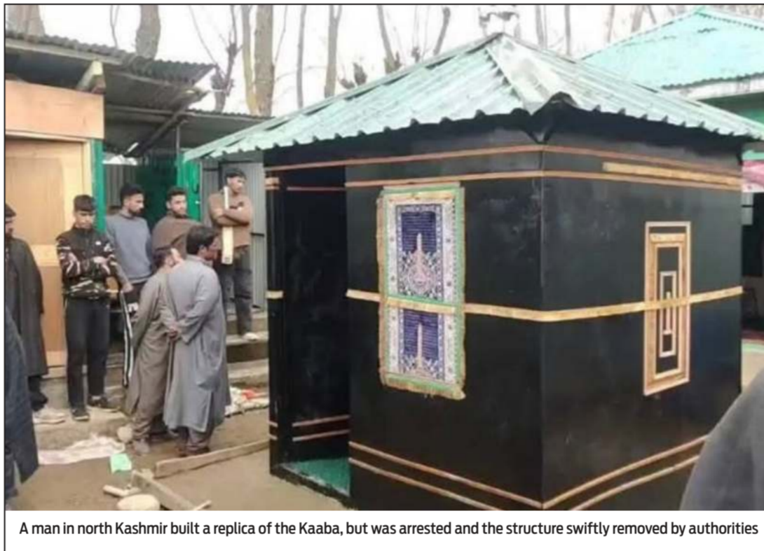
A man in north Kashmir built a replica of the Kaaba, but was arrested and the structure swiftly removed by authorities

The Waripora Kunzar incident underscores the need for critical thinking in matters of faith. Blind reverence without discernment allows fraudulent individuals to manipulate religious sentiments for personal gain. The lesson here is to question, verify, and not follow blindly. Faith should be rooted in knowledge, not superstition. People must educate themselves to distinguish genuine spirituality from deceit, ensuring that devotion does not become a tool for manipulation in the hands of opportunists.