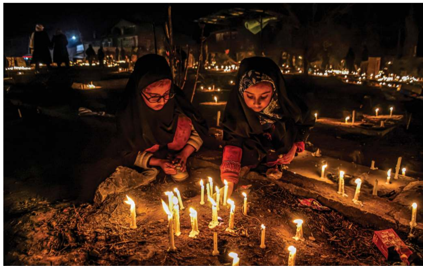
People lit candles on graves at Babamazar graveyard at Zadibal on the occasion of Shab-e-Barat.

Despite the Waqf Act of 1995 becoming applicable to Jammu & Kashmir in 2019, the Union Territory government has neither framed rules under the law nor constitute tribunals under it. This disclosure was made by the Ministry of Minority Affairs (MoMA) before the Joint Parliamentary Committee on the Waqf (Amendment) Bill-2024. | More on P6