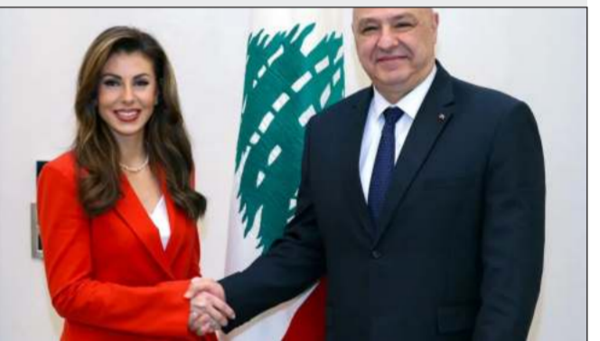
U.S. deputy Mideast envoy Morgan Ortagus (L) with Lebanese President Joseph Aoun

A photo showing U.S. President Donald Trump's deputy Middle East envoy donning a ring embellished with the Star of David to a meeting with Lebanon's leader triggered outrage in Arabic social and broadcast media.