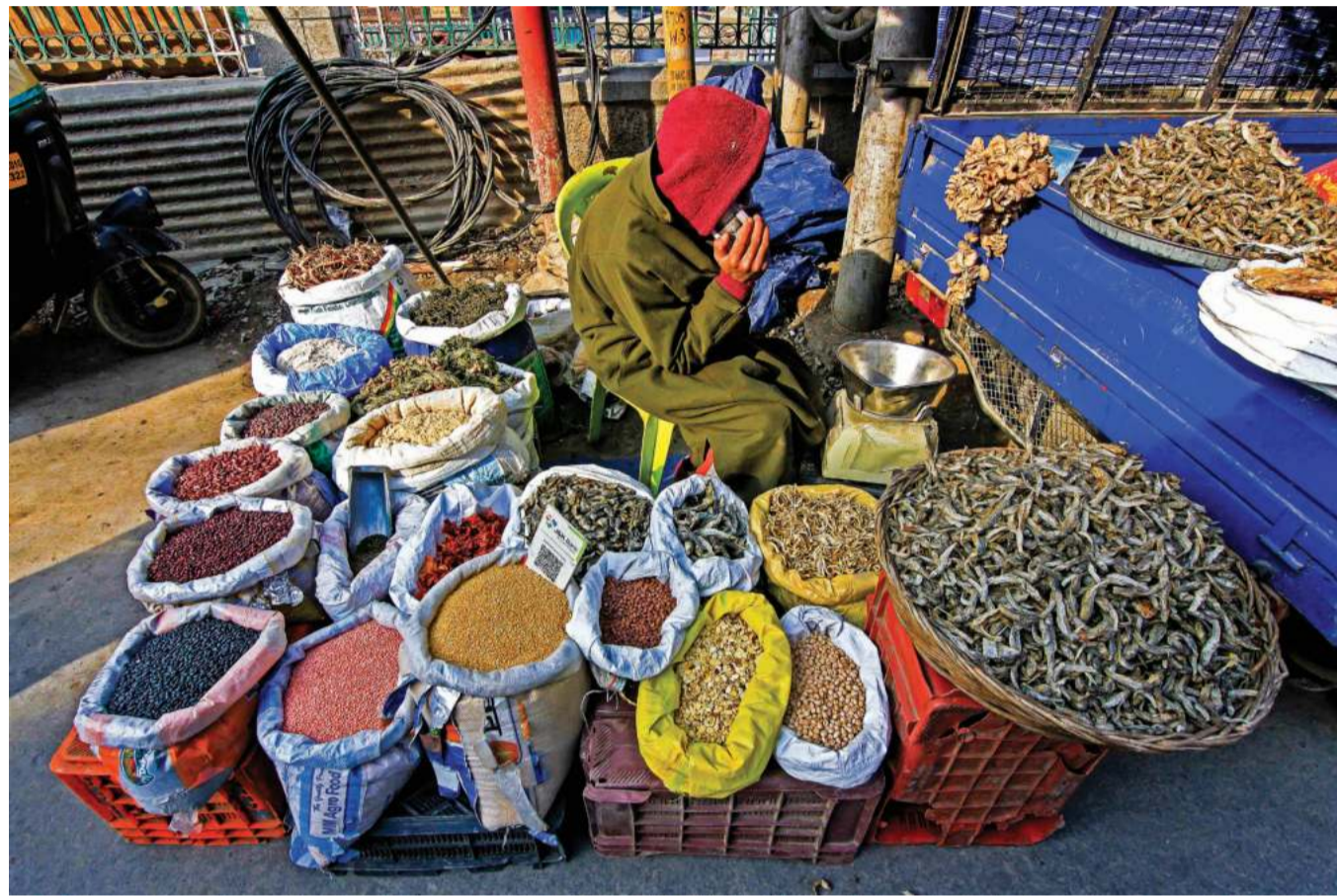
Kashmir's Winter Pantry: A vendor displays Hokh Syun - a colorful assortment of dried vegetables, cereals and dried fish. From earthy browns to vibrant reds, these dried vegetables tell a story of tradition and flavor. KO Photo Faisal Khan

The Part-C of the Business Rules outlines the procedure for initiating | More on P6