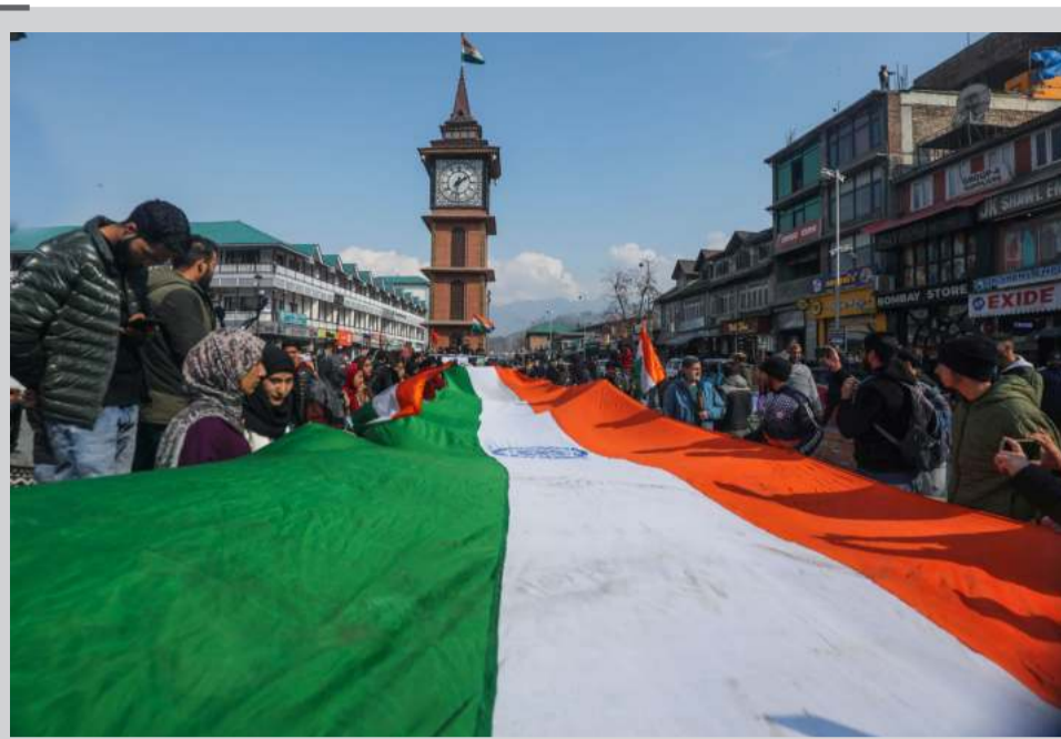
ABVP organized a Tiranga Rally which commenced from the TRC and culminated at the historic Clock Tower at Lal Chowk..