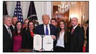
at a White House event.

"Most people don't even know about it. We have 30,000 beds in Guantanamo to detain the worst criminal illegal aliens threatening the American people," Trump said