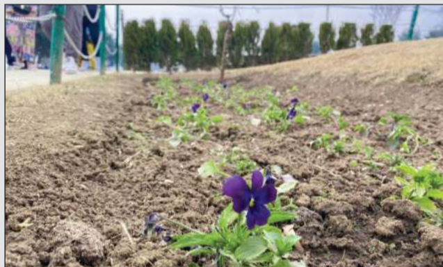
Srinagar recorded a maximum temperature of 15 degrees Celsius in mid-January, which is almost 8 degrees above normal. "For the last several decades, temperatures | More on P6

The Indian Meteorological Department (IMD) Centre in