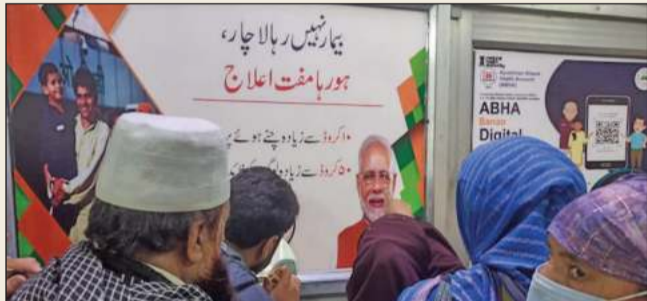
raised alarms among patients, healthcare providers, and stakeholders across the region. The procedures in

Srinagar: In a move set to disrupt the private healthcare sector, the Jammu and Kashmir Government is contemplating a shift in its policy under the Ayushman Bharat Scheme, which could result in the exclusion of four commonly sought surgical procedures from private hospitals. The new policy, under review and set to take effect from March 15, 2025, has