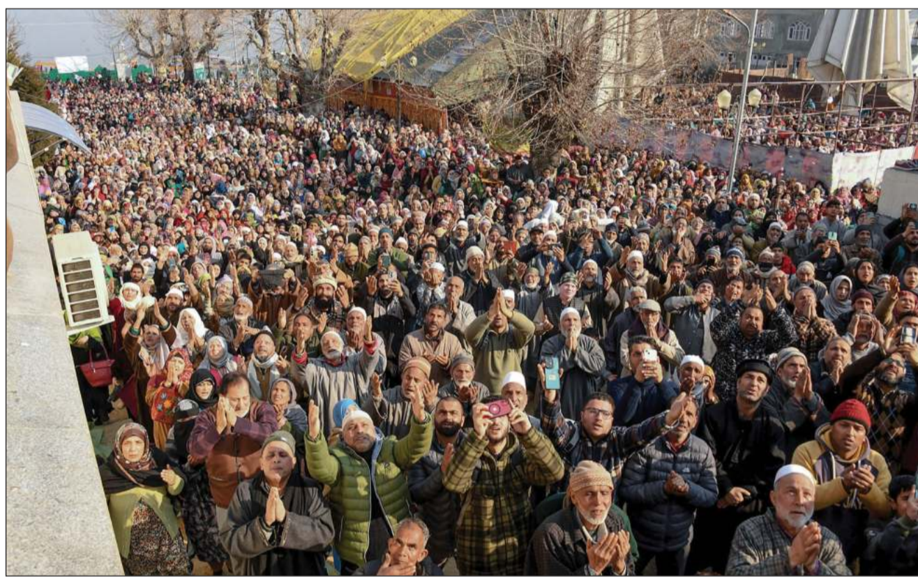
Thousands thronged Hazratbal Shrine to witness the holy relic of Prophet Muhammad (Pbuh) on the day following Shab-e-Me'raj.

"The committee, in order to evade such apprehensions, proposes that a proviso clearly specifying that | More on P7