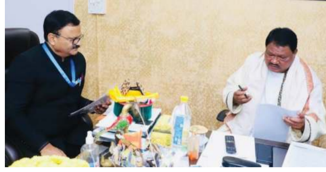
Centre to develop a Tribal Smart Village with modern infrastructure, renewable energy solutions and digital connectivity. This project is envisioned as a model for sustainable and inclusive

Rana emphasised the transformative potential of these schools in empowering tribal youth. He sought support of the