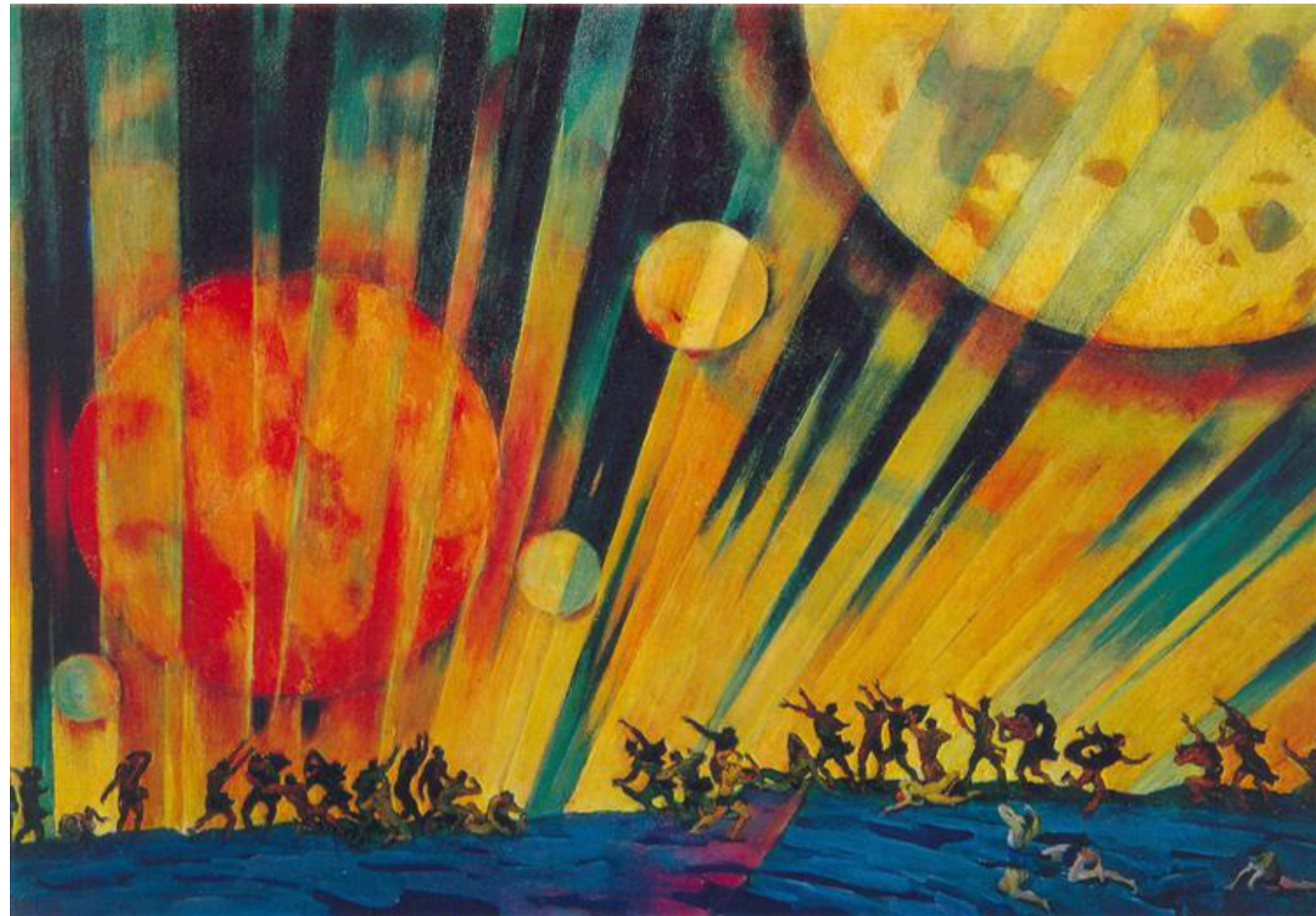
Konstantin Yuon, "New Planet," 1921

The history of storytelling dates back thousands of years, where early humans used cave paintings and oral traditions to convey their experiences, beliefs, and societal norms. These narratives, whether factual accounts or mythical tales, provided a framework for understanding the world and passing down cultural heritage from one generation to the next. Ancient civilizations like the Greeks used written narratives to chronicle their histories and mythologies, setting the stage for the written word as a powerful tool of cul-