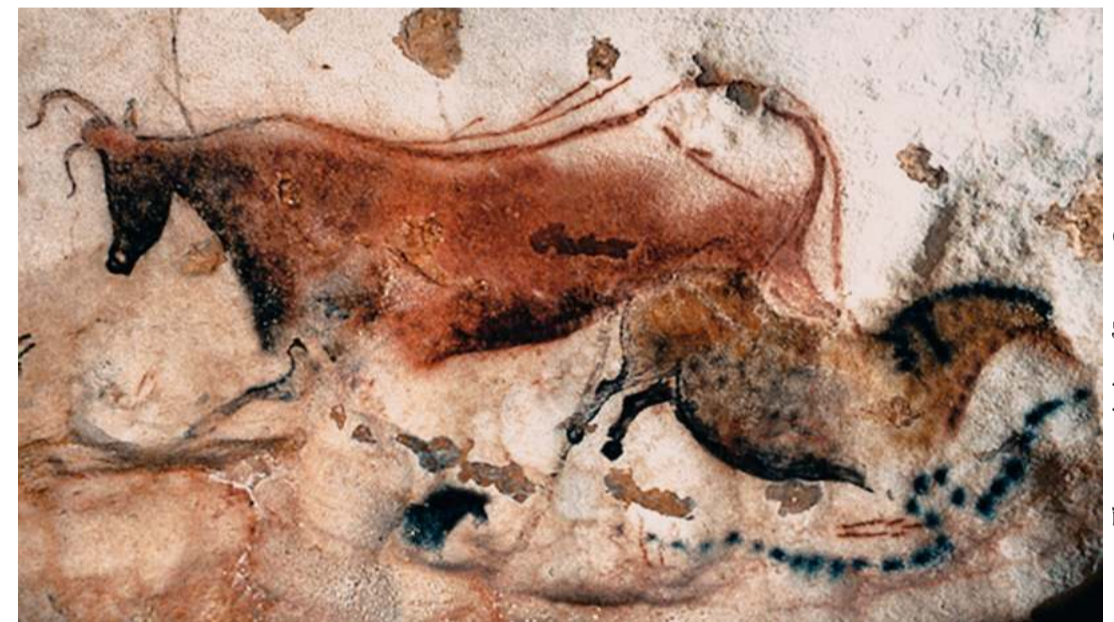
The cave painting of Lascaux Cave

In conclusion, storytelling stands as a timeless art form that bridges the past with the present, offering insights into human experience and shaping the future through its narratives. Whether through ancient myths or modern narratives, storytelling continues to influence