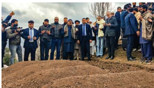
Chief Minister during a visit to Badhaal village, where 17 people, including 13 children, died under mysterious circumstances in the past one-and-a-half month, in Rajouri.

Talking to reporters during his visit to the village to express sympathy with the bereaved families, Omar said building big hospitals everywhere is not possible but inadequacy in the health sector at district levels will be addressed to provide better healthcare facilities to people