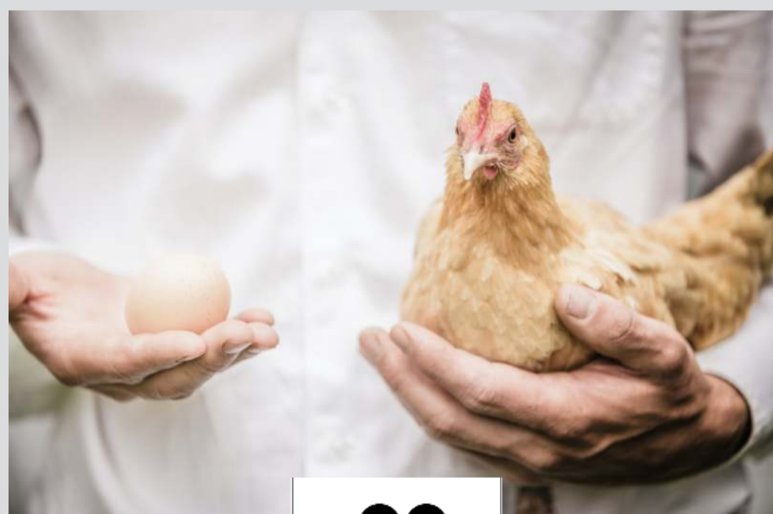
a passing thought?

Why does it matter whether thoughts or feelings come first? The distinction is important, as learning to manage your emotions depends on identifying how your thoughts trigger your emotional reactions. Emotions are tethered to our thoughts, but we may not recognize the threads of the tether that bind them. The lesson here is clear: to better manage our emotions, we need to catch the underlying thought triggers and practice thinking differently. But there's a catch: How do we catch such a slippery target as